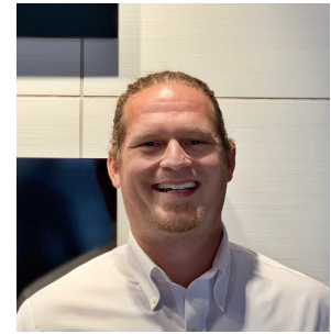
Weston Hall Cummins, Inc.