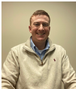
Matthew Kincade Benefits, Inc.