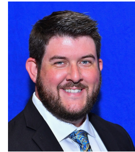
Alden Ward Dollar General